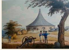
Earliest view, 1820 @ commons.wikimedia... Earliest_known_view_...

Wikimedia Commons and The National Archives / public domain