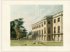
Carlton House, 1819