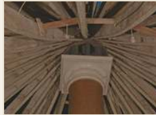
King post near apex