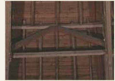
Mid-height bracing