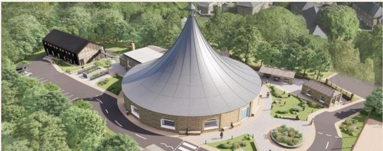
The Rotunda within a restored public realm.

The visualisations below were prepared by GEB's design team. They are reference images, not consented planning proposals.