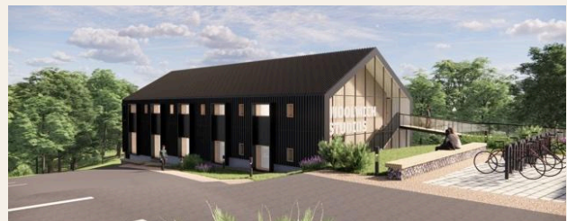
Wider site aerial; Woolwich Studios from above; Woolwich Studios entrance; Woolwich Studios courtyard. Visualisations courtesy Greenwich Enterprise Board.