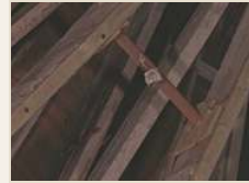
Bracing and sarking