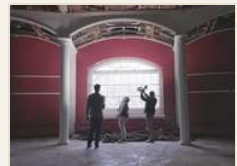
Arched window