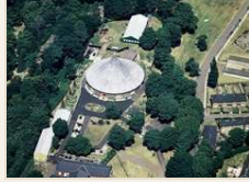
Aerial, 1975