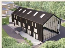
Studios from above Visualisation courtesy Greenwich Enterprise Board