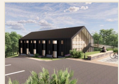
Studios courtyard Visualisation courtesy Greenwich Enterprise Board

FennecMedia / CC BY 4.0 International / interior of the Rotunda, March 2026