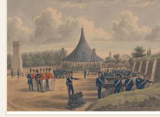
Grant view, 1844