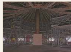
Colonnade @ rotundatrusted.org.uk CC BY 4.0