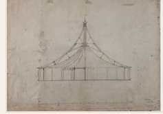
Section, 1814