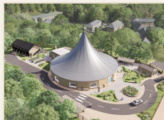
Restored public realm Visualisation courtesy Greenwich Enterprise Board

Greenwich Enterprise Board / visualisations of the wider site, 2026