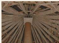
Interior geometry

interior of the Rotunda, March 2026