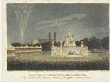
Temple of Concord, 1814