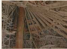
Truss perspective