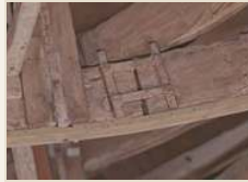
Iron strap connection