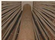
Central column @ rotundatrusted.org.uk CC BY 4.0