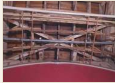
Perimeter ties