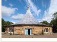
Exterior, south @ commons.wikimedia... Rotunda_Woolwich_Ge...