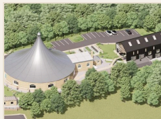
Wider site aerial Visualisation