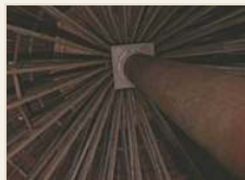
Column from below