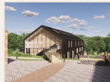
Hookwick entrance