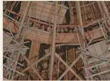
Inspection walkway

Every tile is a hyperlink. Wikimedia tiles link to the Commons file page. GEB and FennecMedia tiles link to rotundatrust.org.uk.