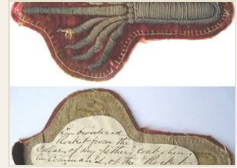
Rocket badge, 1832

Greenwich Enterprise Board / visualisations of the wider site, 2026